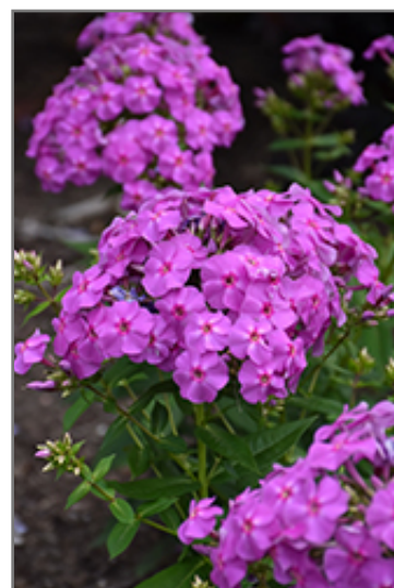
Flame Lilac Garden Phlox flowers