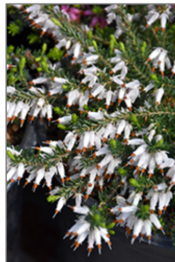
Springwood White Heath flowers