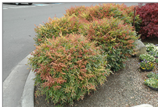
Sienna Sunrise Nandina