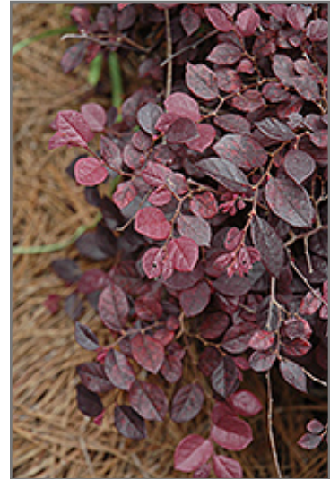
Purple Pixie Fringeflower foliage

This plant is not reliably hardy in our region, and certain restrictions may apply; contact the store for more information.