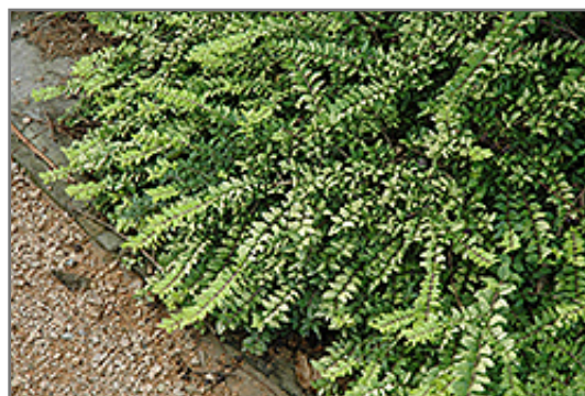
Edmee Gold Honeysuckle