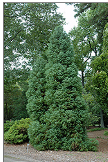
Elegans Japanese Cedar