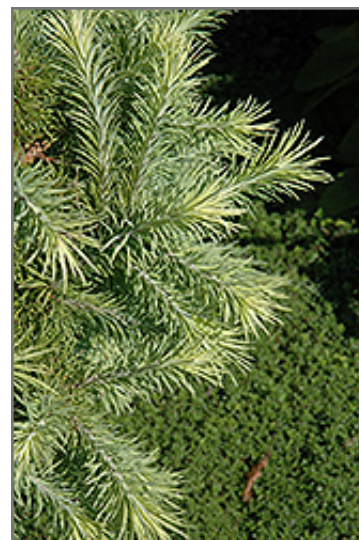
Wolterdingen Japanese Larch foliage