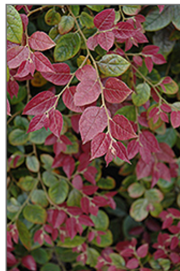
Razzleberri Fringeflower foliage