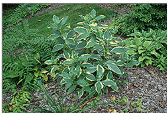
Lemon Wave Hydrangea