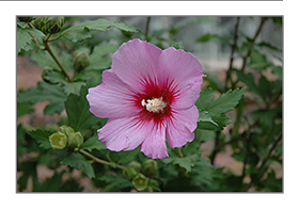
Pink Flirt Rose of Sharon flowers