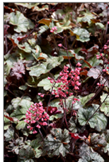
Mysteria Coral Bells flowers