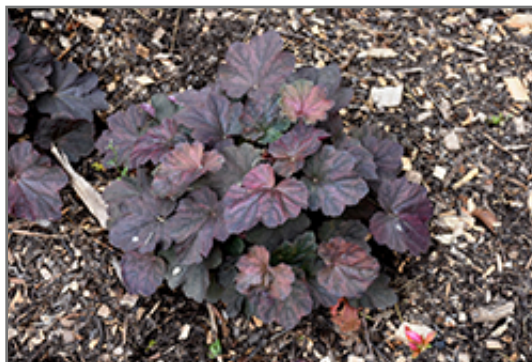
Mocha Coral Bells