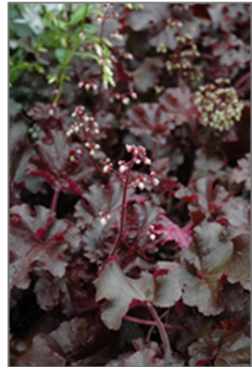
Melting Fire Coral Bells flowers

Melting Fire Coral Bells is a fine choice for the garden, but it is also a good selection for planting in outdoor pots and containers. It is often used as a 'filler' in the 'spiller-thriller-filler' container combination, providing a mass of flowers and foliage against which the larger thriller plants stand out. Note that when growing plants in outdoor containers and baskets, they may require more frequent waterings than they would in the yard or garden.