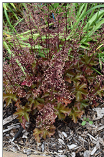
Melting Fire Coral Bells in bloom