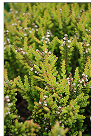
Firefly Heather foliage