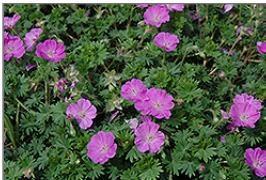
Little Bead Cranesbill flowers