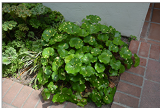
Variegated Leopard Plant