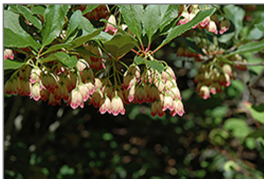
Hollandia Red Enkianthus flowers