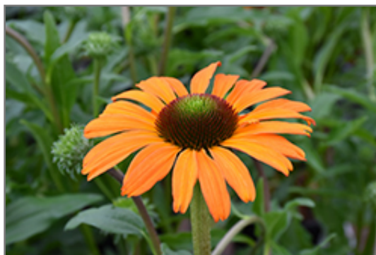
Tangerine Dream Coneflower flowers