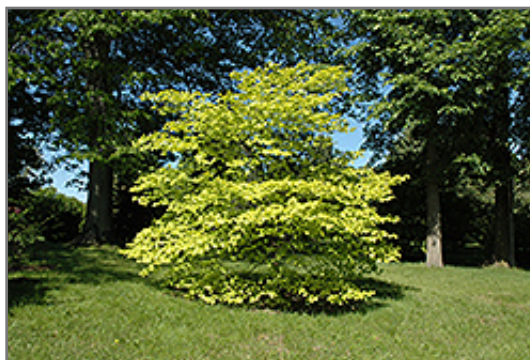
Golden Nugget Flowering Dogwood