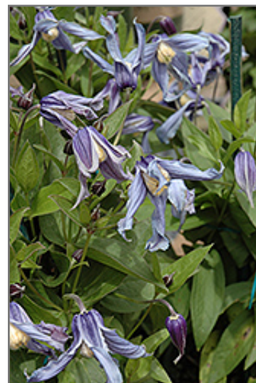
Caerulea Solitary Clematis flowers

Caerulea Solitary Clematis is recommended for the following landscape applications;