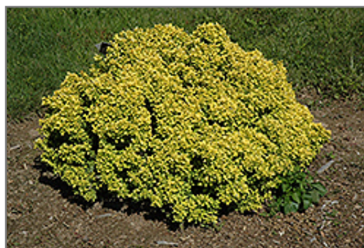
Golden Devine Dwarf Japanese Barberry