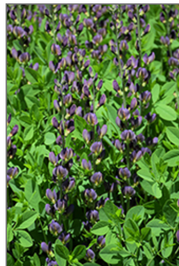
Twilite Prairieblues False Indigo flowers