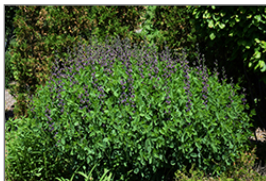
Twilite Prairieblues False Indigo in bloom