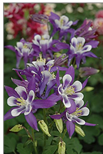
Winky Blue And White Columbine flowers

Winky Blue And White Columbine is recommended for the following landscape applications;