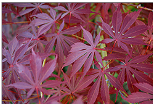
Sherwood Flame Japanese Maple foliage