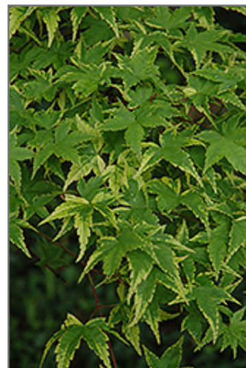
Sagara Nishiki Japanese Maple foliage