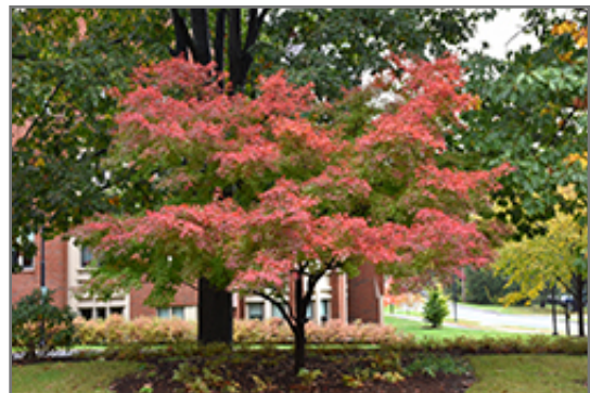
Beni Tsukasa Japanese Maple in fall