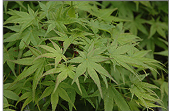
Beni Tsukasa Japanese Maple foliage