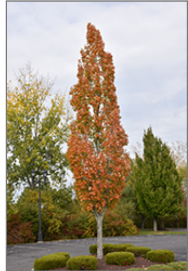
Armstrong Maple in fall

This tree should only be grown in full sunlight. It is quite adaptable, preferring to grow in average to wet conditions, and will even tolerate some standing water. It is not particular as to soil type or pH. It is highly tolerant of urban pollution and will even thrive in inner city environments. This particular variety is an interspecific hybrid.