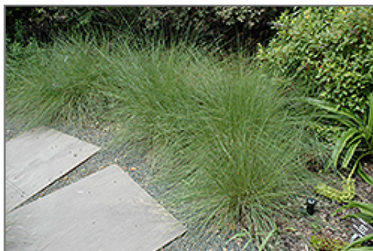
Hairawn Muhly

Hairawn Muhly is recommended for the following landscape applications;