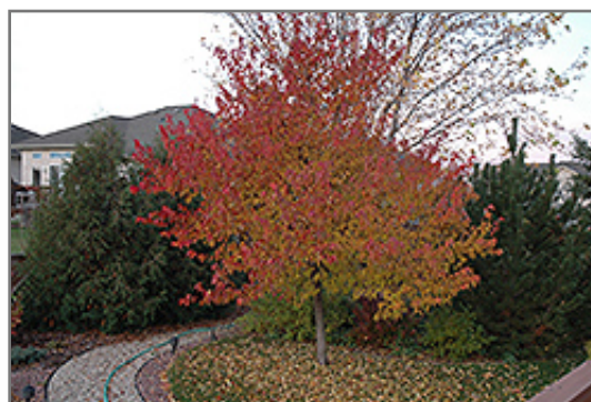
Embers Amur Maple in fall