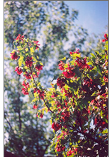
Embers Amur Maple fruit

This tree does best in full sun to partial shade. It is very adaptable to both dry and moist locations, and should do just fine under average home landscape conditions. It is not particular as to soil type or pH. It is highly tolerant of urban pollution and will even thrive in inner city environments. This is a selected variety of a species not originally from North America.