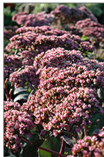
Maestro Stonecrop flowers

Maestro Stonecrop is recommended for the following landscape applications;