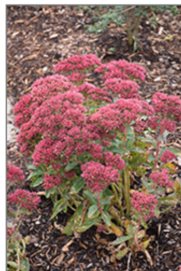
Munstead Dark Red Stonecrop in bloom