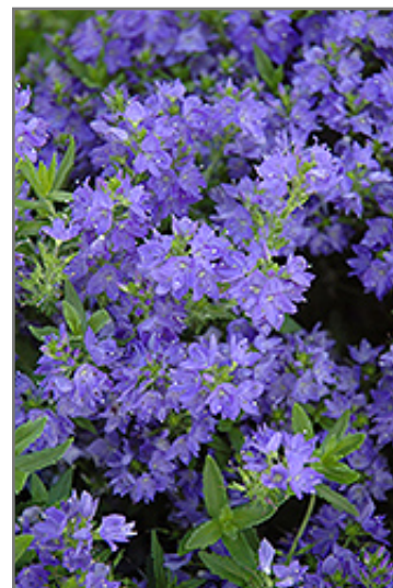
Trehane Creeping Speedwell flowers

Trehane Creeping Speedwell is recommended for the following landscape applications;