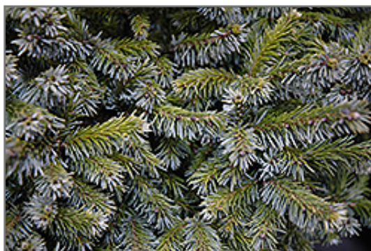
Gunther Dwarf Spruce foliage