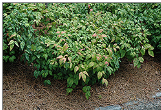
Fire Power Nandina