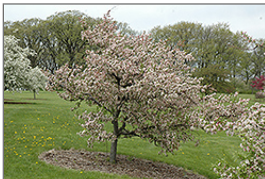
Leprechaun Flowering Crab in bloom

Leprechaun Flowering Crab will grow to be about 8 feet tall at maturity, with a spread of 8 feet. It has a low canopy with a typical clearance of 2 feet from the ground, and is suitable for planting under power lines. It grows at a medium rate, and under ideal conditions can be expected to live for 50 years or more.