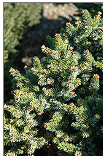
Pimoko Spruce foliage