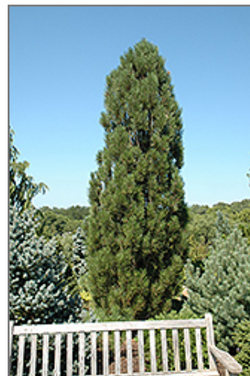
Arnold Sentinel Austrian Pine

Arnold Sentinel Austrian Pine will grow to be about 20 feet tall at maturity, with a spread of 5 feet. It has a low canopy, and is suitable for planting under power lines. It grows at a medium rate, and under ideal conditions can be expected to live for 40 years or more.