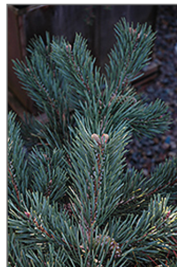
Albyn Prostrate Scotch Pine foliage