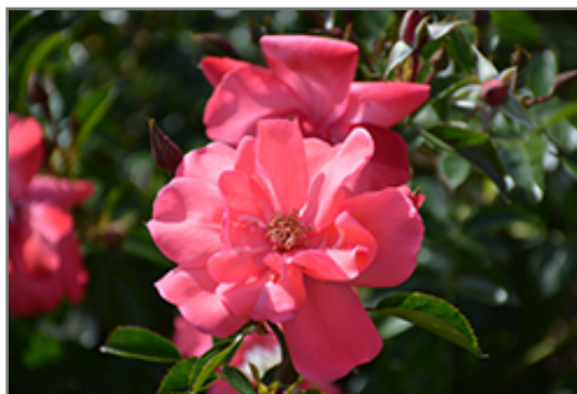
Lady Elsie May Rose flowers