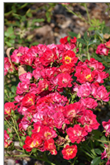
Pink Drift Rose flowers

Pink Drift Rose is recommended for the following landscape applications;