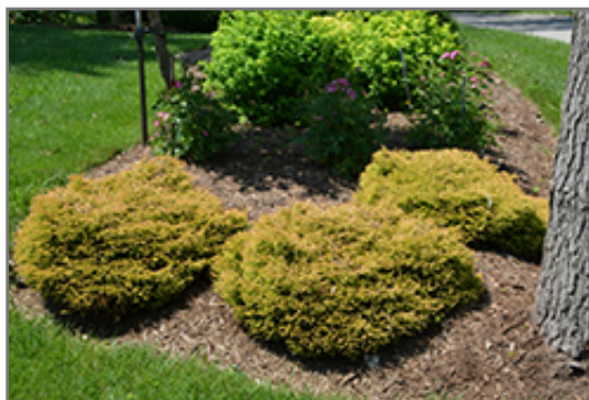
Golden Tuffet Arborvitae