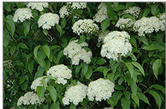
Nannyberry flowers