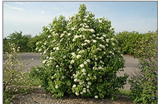
Nannyberry in bloom