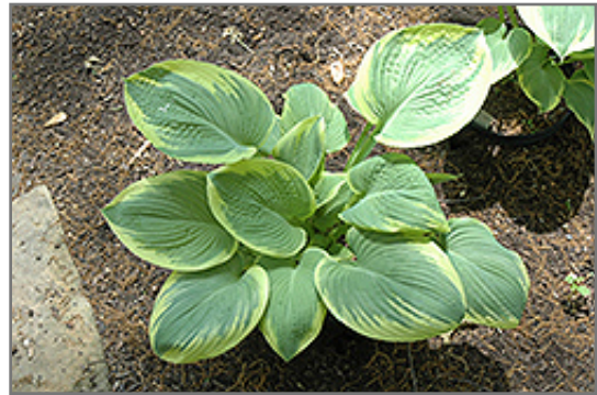
Robert Frost Hosta