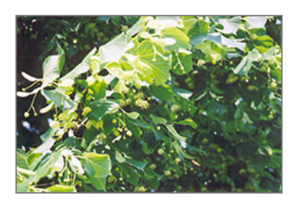
Littleleaf Linden flowers