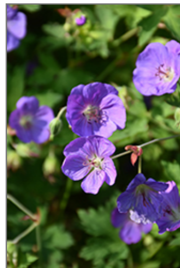
Jolly Bee Cranesbill flowers