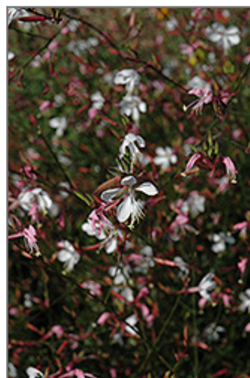
Snowstorm Gaura flowers