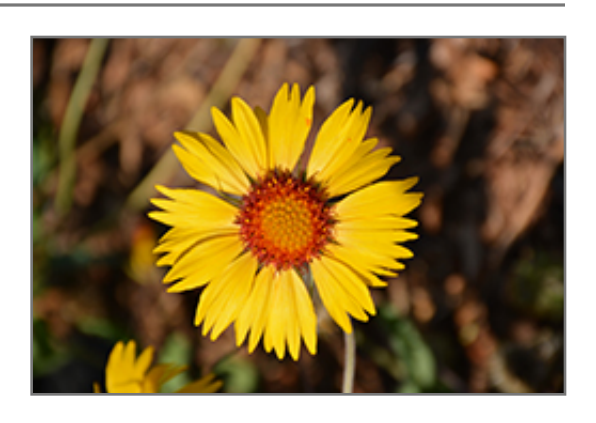
Amber Wheels Blanket Flower flowers