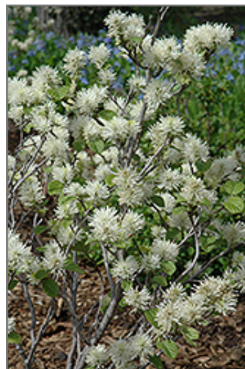
May Bouquet Fothergilla flowers