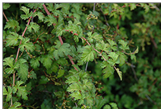
Cutleaf Stephanandra foliage