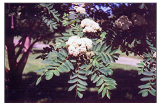
Showy Mountain Ash flowers